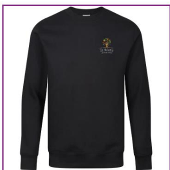
St Helen's School Crew Neck PE Sweatshirt Black

Uniform for September: As you know we have trialled in KS2 wearing PE kit to school on PE days. This has been very successful over this term and will become the norm next year for all children across the school. For this to happen, all children will need to wear the correct uniform for PE. We are giving you a significant amount of time to purchase the correct uniform either from our new uniform suppliers Linela or from Monkhouse, who are running a sale until the end of this term, FOSH or shops where plain black shorts and joggers can be bought (in the winter months, plain black tracksuit jogging bottoms will be need). It is very noticeable that the younger KS1 children adhere to our PE uniform policy really well, but is something that we feel as a staff needs to be developed for some children in KS2. Wearing smart uniform, where all children have the same standards is something that we aspire to and as we have stated before, secondary schools have a zero tolerance policy on uniform. A part of getting children ready for secondary school begins with setting the correct standard for uniform. I have been asked before why this 'small thing matters'- how does it impact children's work?