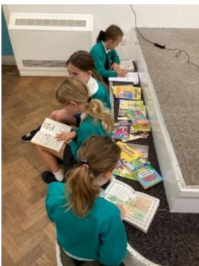
Breakfast Club Reading

Reading at St.Helen's! As you know, one of the most precious things we love at St.Helen's is reading and trying to foster a children's love of reading and reading for pleasure is something all our staff are determined to do. Whatever a child's starting point or educational need, we try to endeavour to support our children to develop their reading and to love what they decide to pick up and read. The photos below show just a few ways we help develop a love of reading: from book shelves around school, the opportunity to devour a book at breakfast club, or to find a quiet time at break time to read something from our reading shed.