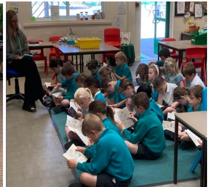
Just Read in Class