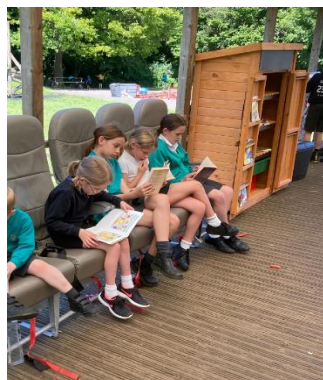
Reading Shed and Reading Seats