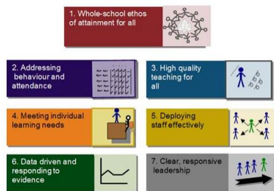
Figure 2: Building blocks for success

We have also considered information taken from the DFE report: Supporting the attainment of disadvantage pupils. https://assets.publishing.service.gov.uk/government/uploads/system/uploads/attachment_data/file/730628/London_Effect_Qual_Research_-_Research_Report_FINAL_v2.pdf